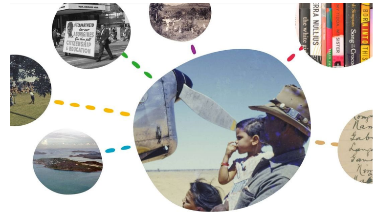
Showcasing Aboriginal and Torres Strait Islander Collections